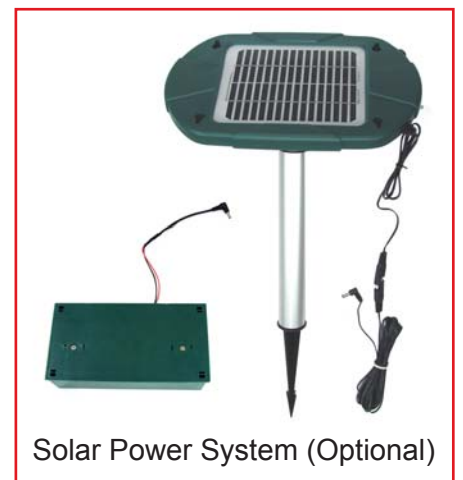
Solar Power System (Optional)