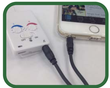
MUSIC RECEIVING FUNCTION